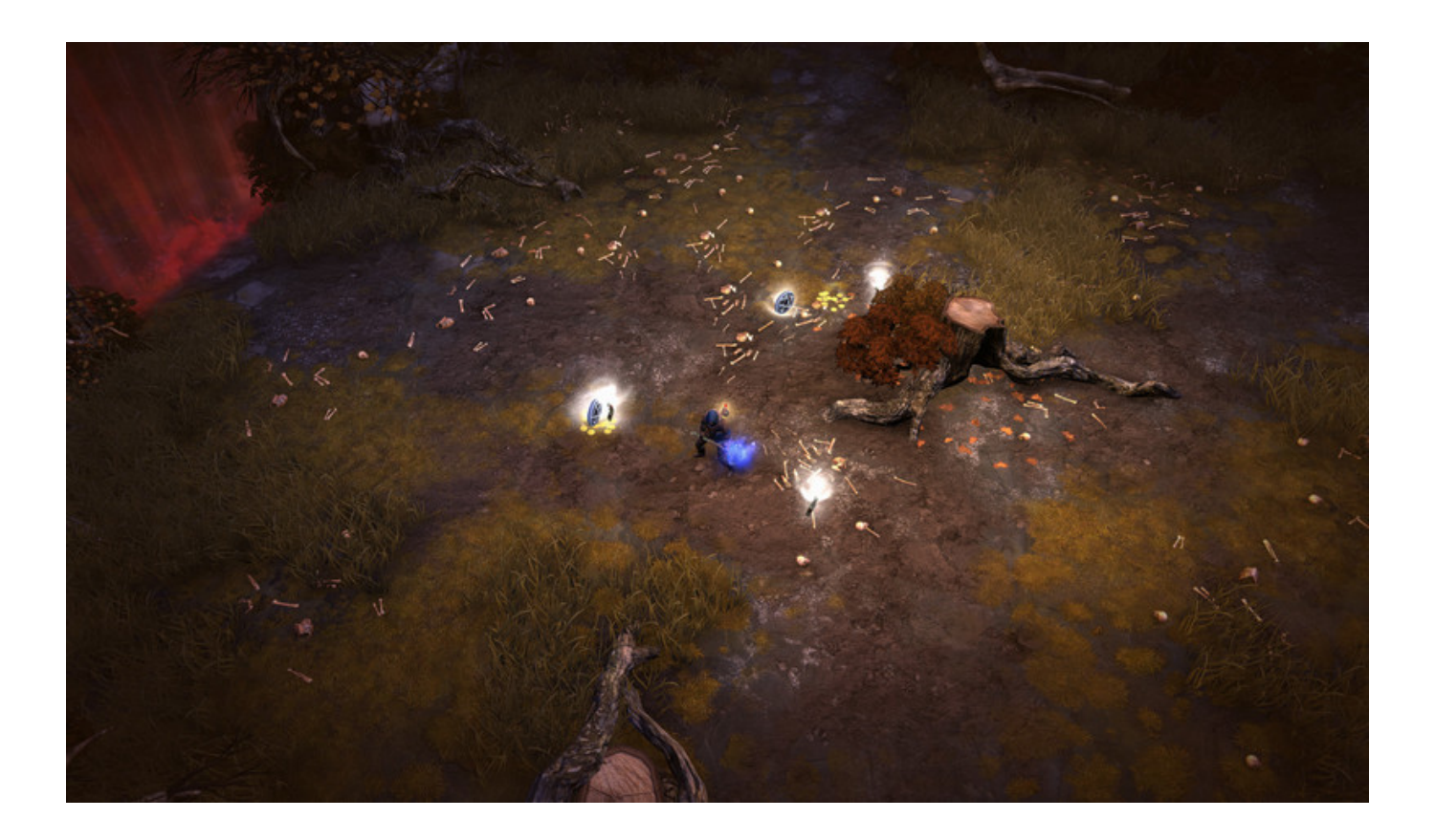
Download ->->-> <a href="http://bit.ly/2NI9T7x">http://bit.ly/2NI9T7x</a>

Going Nowhere: The Dream Crack Download Skidrow